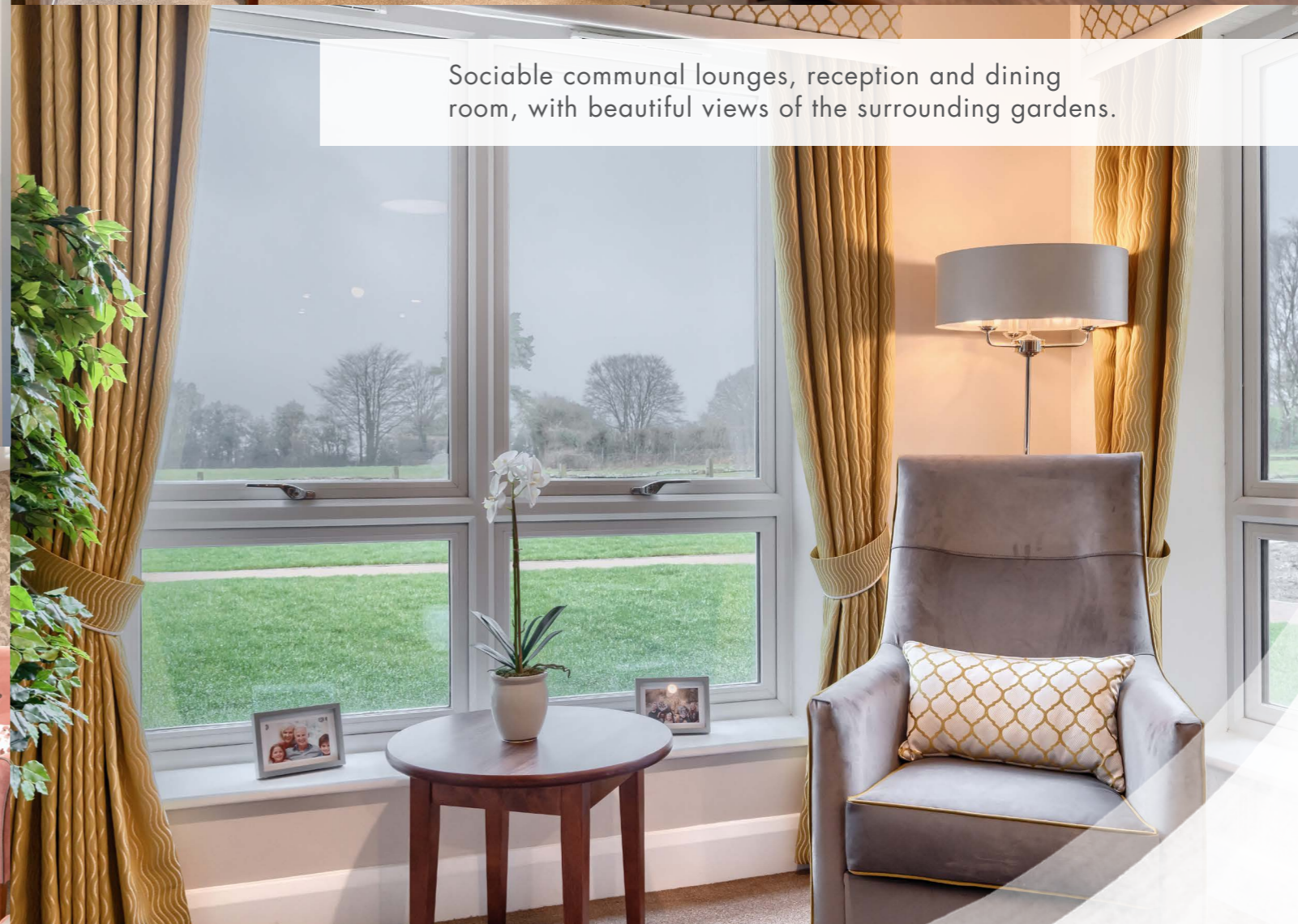
Sociable communal lounges, reception and dining room, with beautiful views of the surrounding gardens.