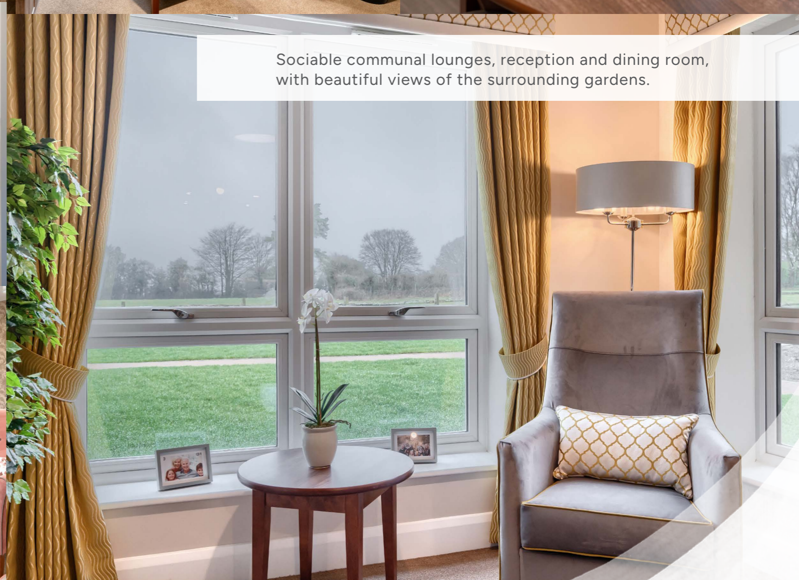
Sociable communal lounges, reception and dining room, with beautiful views of the surrounding gardens.